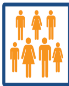
Company Area Group Registration