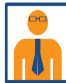
Login for the Scientific Secretariat (for Referees Only)